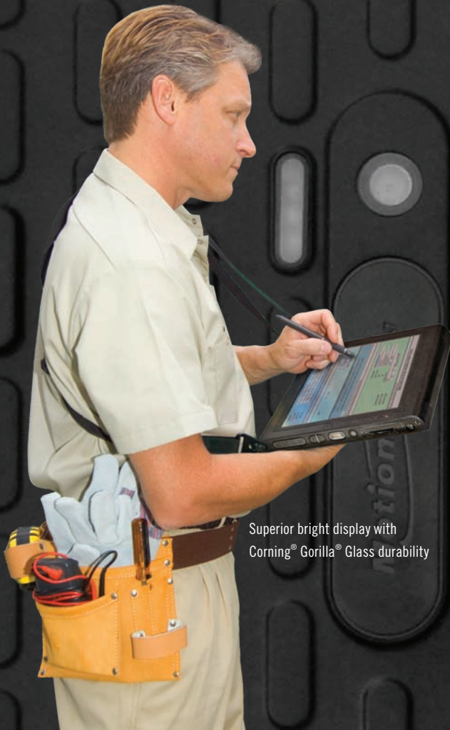
Superior bright display with Corning® Gorilla® Glass durability

Capacitive dual touch Hydis AFFS+ LED backlit display View Anywhere® technology Corning® Gorilla® Glass display protection